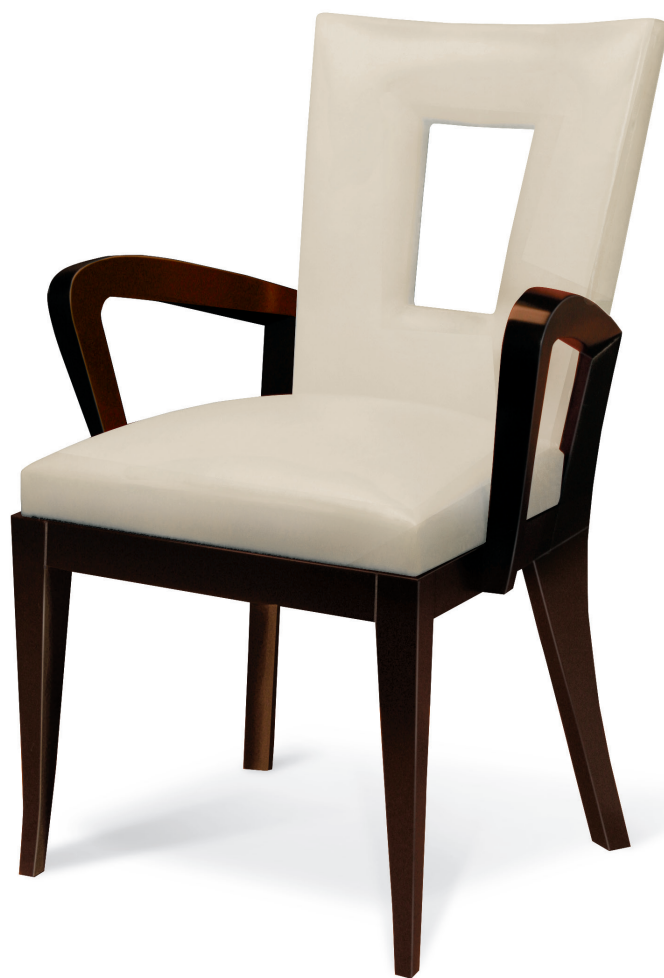
Cadette 2 CHAIR